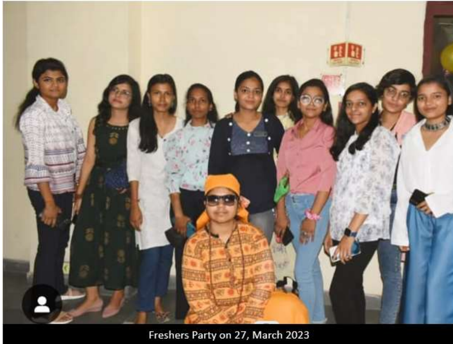
Freshers Party on 27, March 2023

9. Farewell Party: The students of the department organized a farewell party for their seniors on April 25, 2023. The event was a memorable celebration of the graduating class's achievements, offering a space for reflection, gratitude, and connection as they prepare to embark on new journeys.