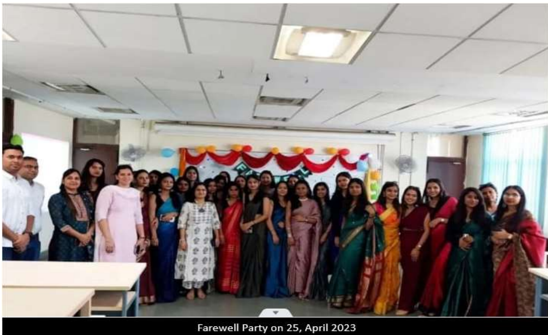
Farewell Party on 25, April 2023