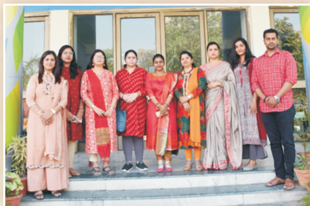
Department of Computer Science