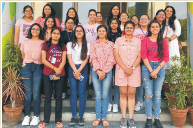
Ehsaas – The Mental Health Awareness Society