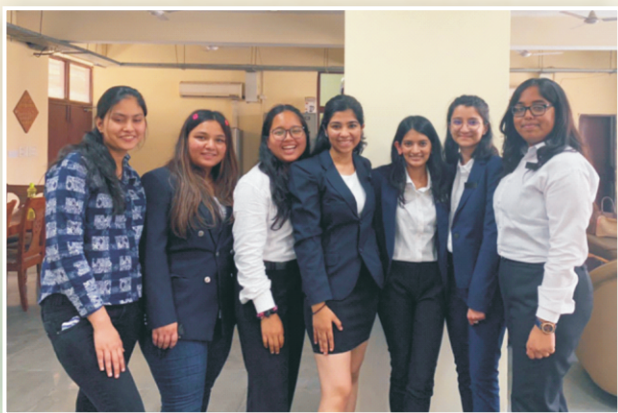
Departmental Council — Financial Studies