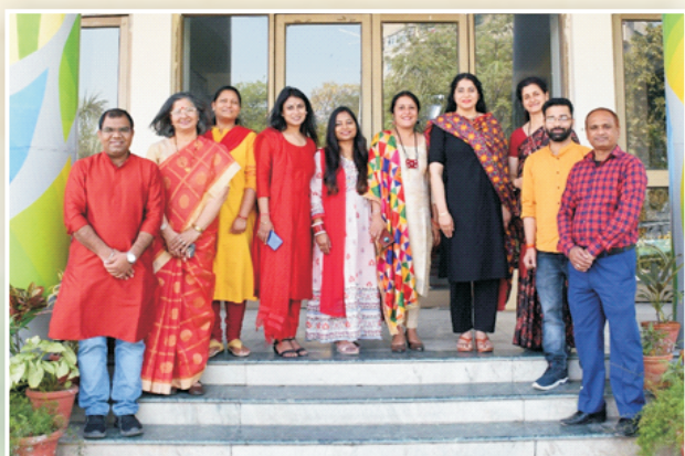
Department of Food Technology