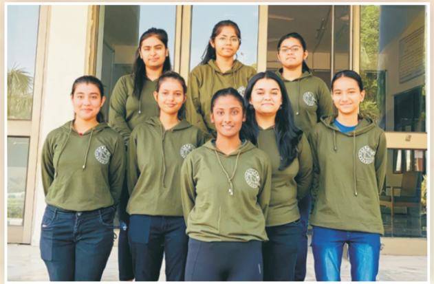
Departmental Council — Chemistry