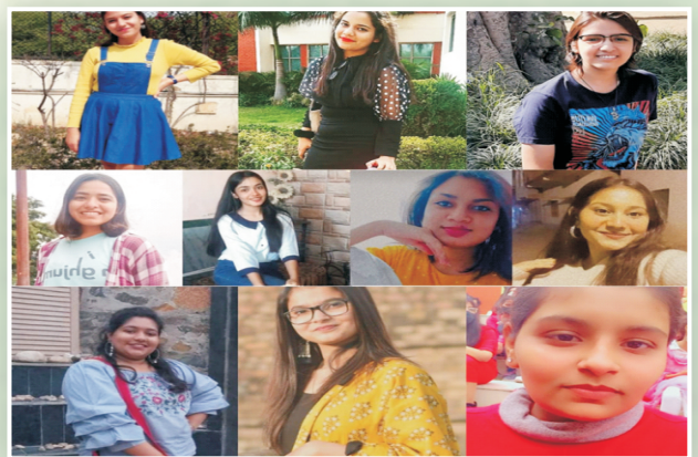
Departmental Council — Food Technology