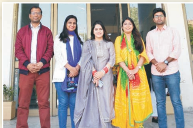
Department of Financial Studies