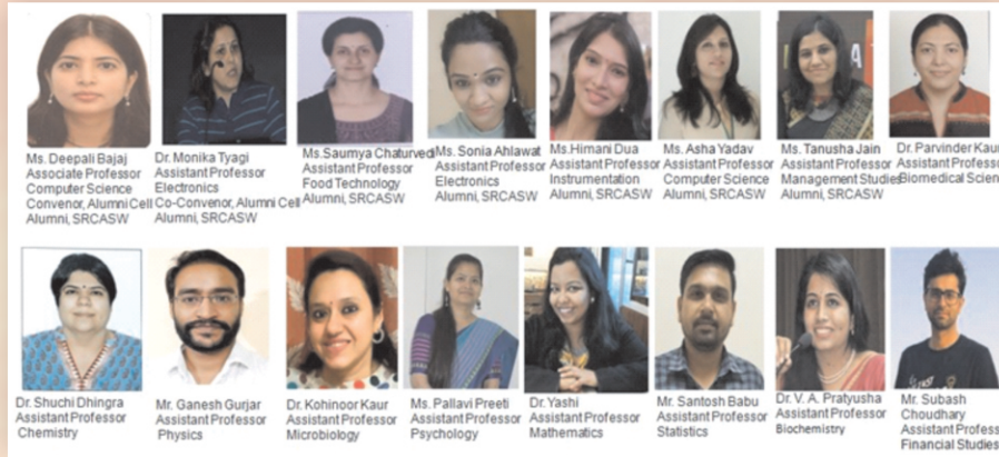
Alumni Cell — Members