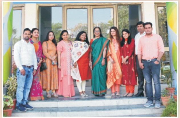
Department of Mathematics