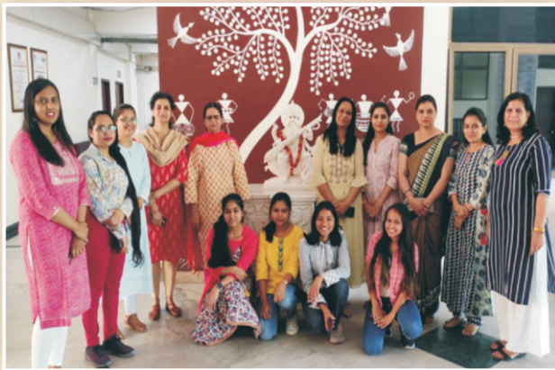
Anubhuti – The Women Development Cell