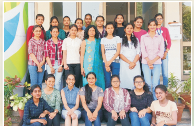
Ek Bharat Shreshtha Bharat (EBSB Club)