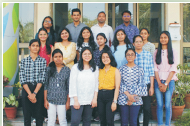
Shufflesots – The Photography Society