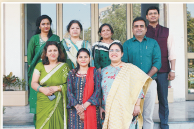
Department of Electronics