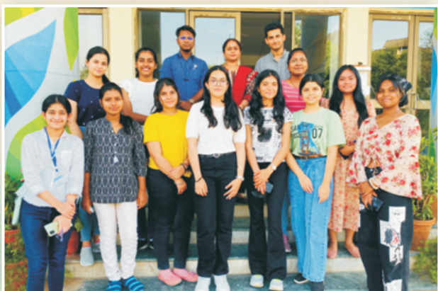
Inklings – The Literary Society