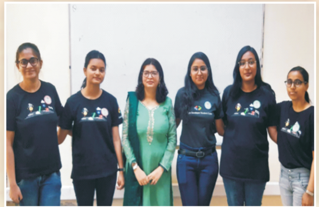
Developer Student Club