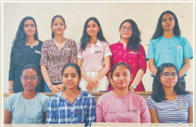
Departmental Council — Electronics