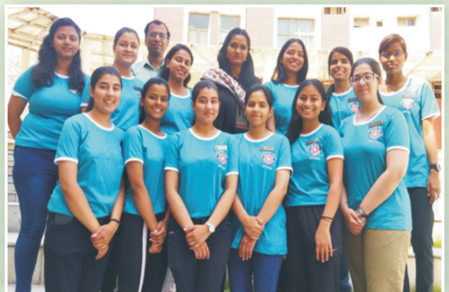
National Service Scheme