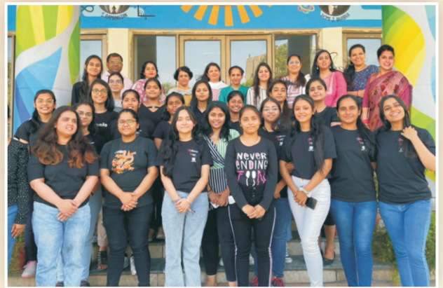
Institution's Innovation Council