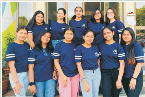
Departmental Council — Statistics