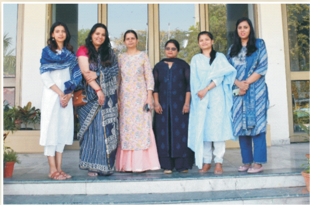
Department of Psychology