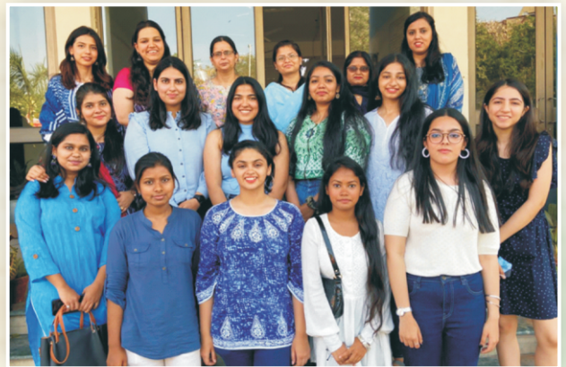
Departmental Council — Psychology