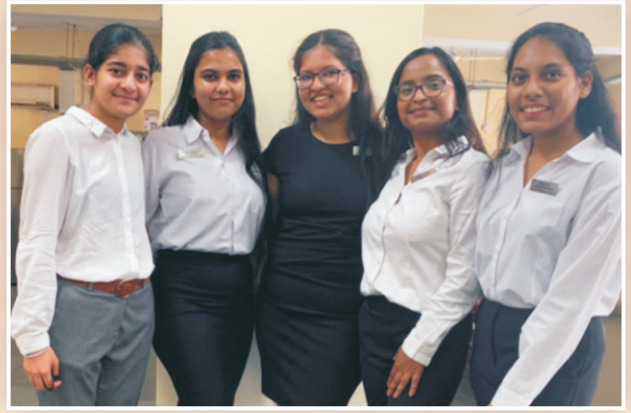
Departmental Council — Management Studies