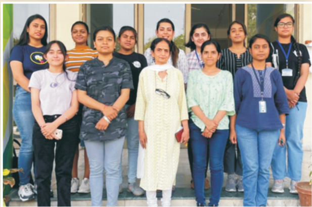
Departmental Council — Physics