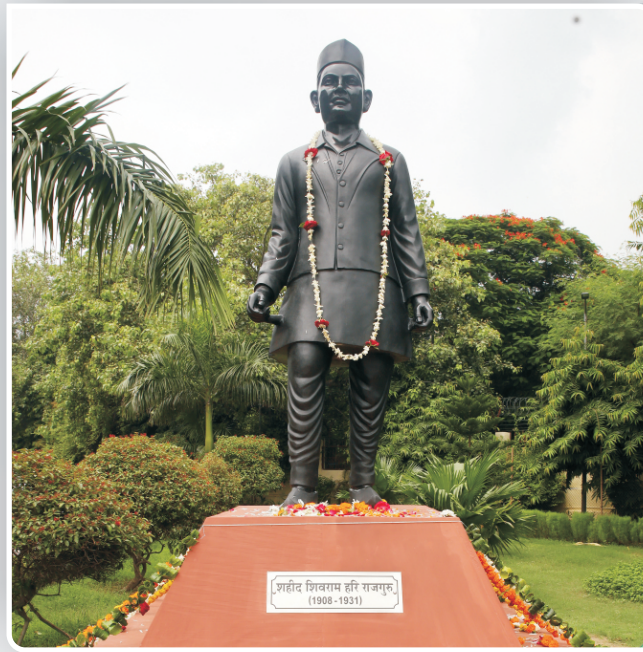
Shivram Hari Rajguru (24 August 1908 — 23 March 1931)

Shivram Hari Rajguru was born in an average middle-class Hindu Brahmin family at Khed in Pune district in 1906. He came to Varanasi at a very early age where he learnt sanskrit and read the hindu religious scriptures. At Varanasi, he came in contact with revolutionaries. He joined the movement and became an active member of the Hindustan Socialist Republican Army (H.S.R.A). Rajguru had fearless spirit and indomitable courage. The only object of his adoration and worship was his motherland for whose liberation he considered no sacrifice too great. He was a close associate of Chandra Shekhar Azad, Sardar Bhagat Singh and Jatin Das. His field of activity was U.P. and Punjab, with Kanpur, Agra and Lahore as his headquarters. Rajguru was a good shooter and was regarded as the gunman of the party. He took part in various activities of the revolutionary movement, the most important being the murder of british police officer, J. P. Saunders at Lahore in 1928.