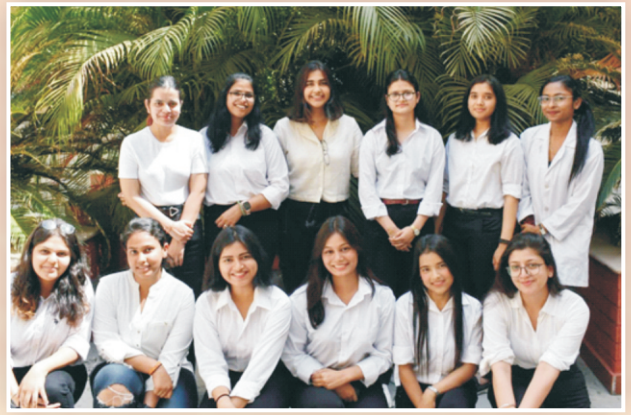
Departmental Council — Biochemistry