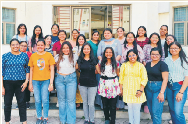
Mark-Haven – The Marketing Society