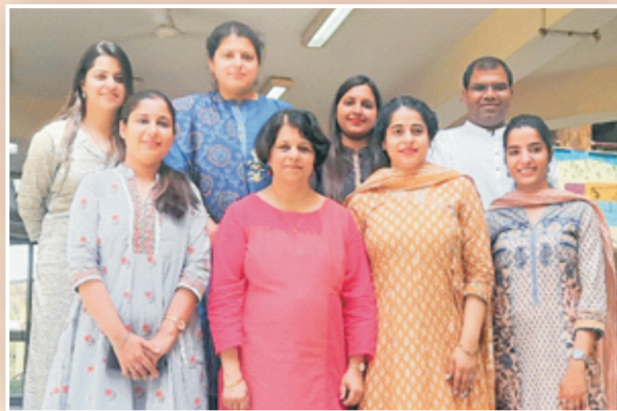
Technology Business Incubator