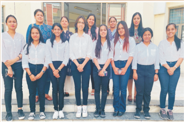
Girl Up Nayaab