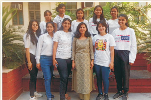
Ahaarya – The Dance Society