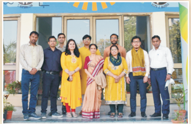
Department of Physics