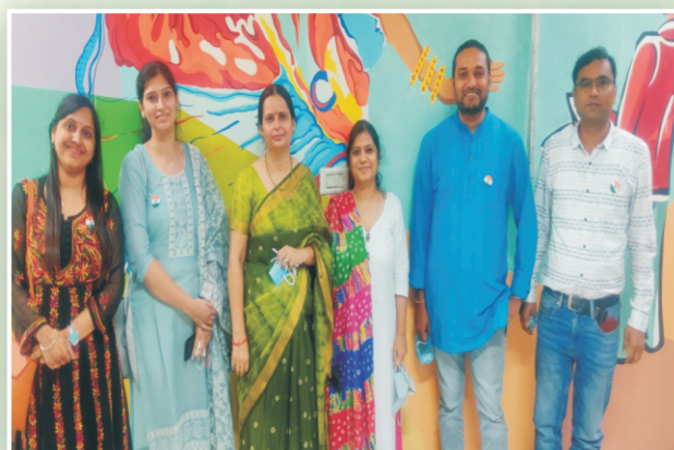
Department of Instrumentation