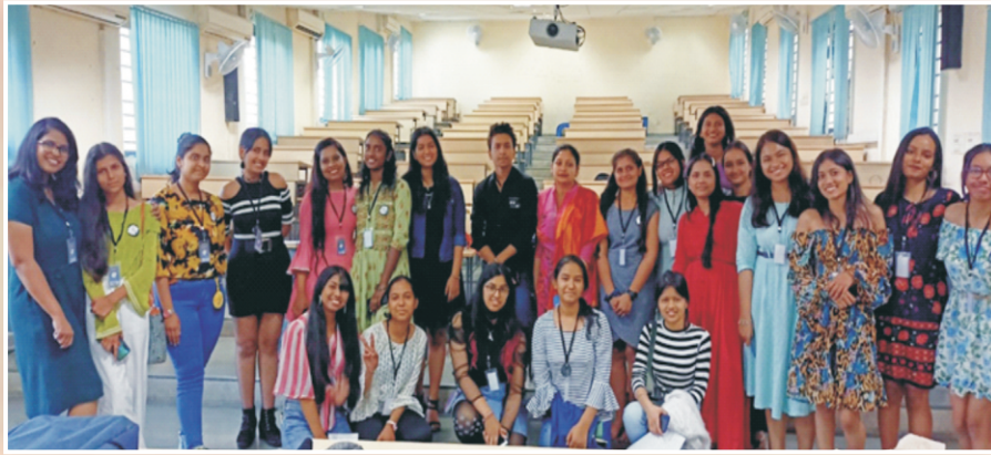
Elvira – The Fine Arts Society