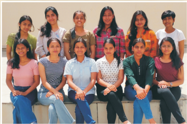
Departmental Council — Computer Science