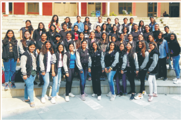
Raqam – The Finance and Investment Society