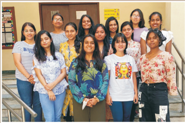
Departmental Council — Biomedical Science