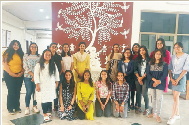
Philyra – The Music Society