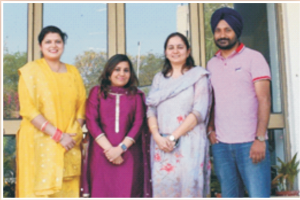
Department of Management Studies