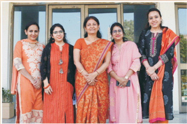
Department of Microbiology