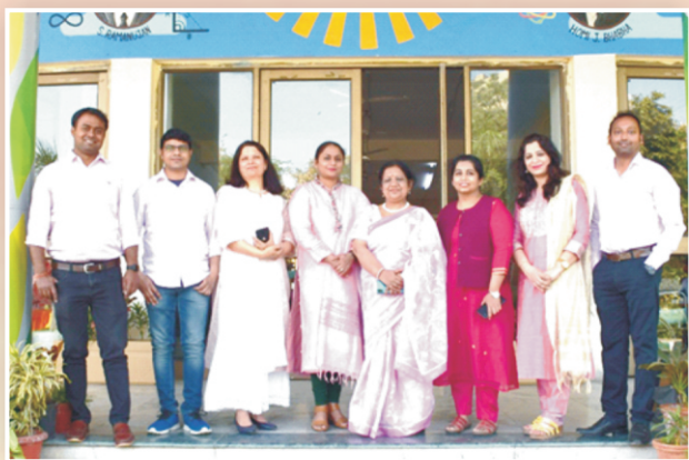
Department of Biochemistry