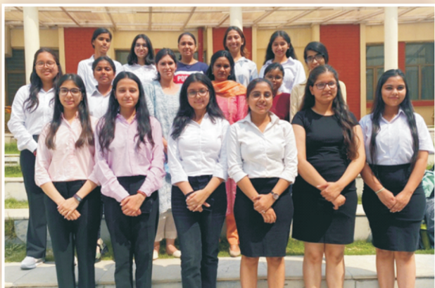
Training & Placement Cell