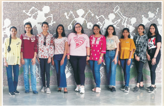
Departmental Council — Microbiology