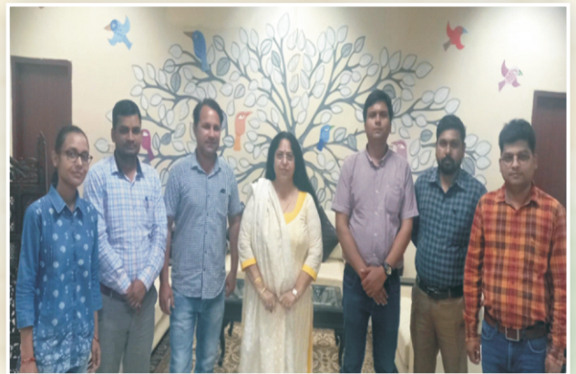
Department of Statistics