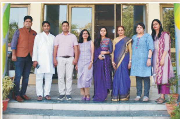
Department of Chemistry