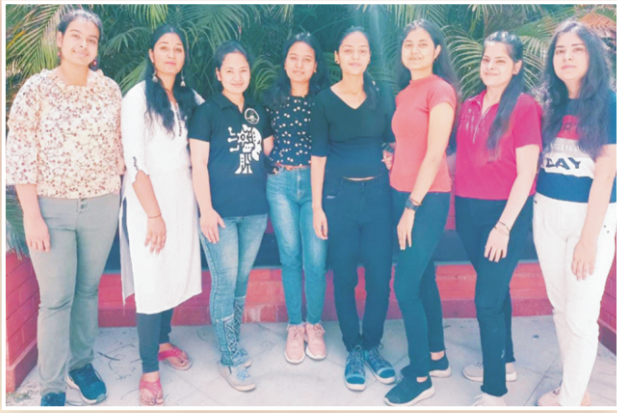
Departmental Council — Instrumentation