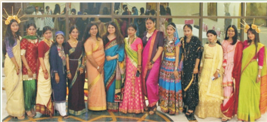
Glamfire – The Fashion Society