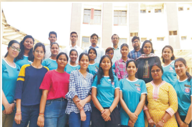
Youth Parliament Society