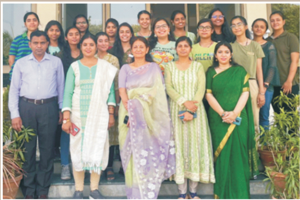
Pravridhi – Eco Club