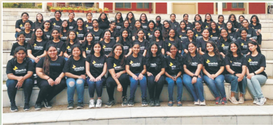
Enactus Shaheed Rajguru College