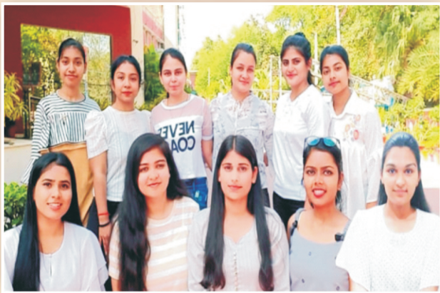
Departmental Council — Mathematics