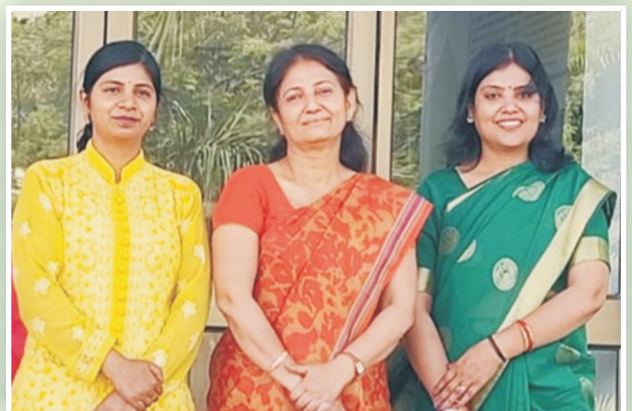
Department of Environmental Science