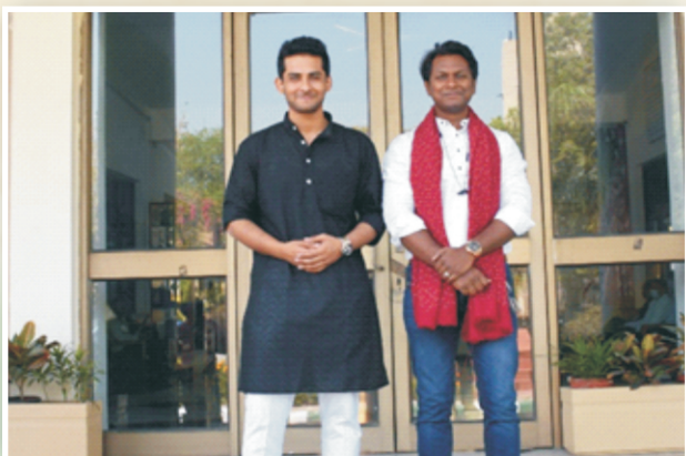
Department of English