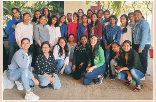
Equilibrium – The Economics Society