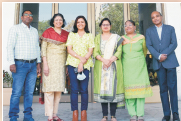
Department of Biomedical Science