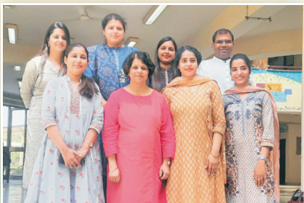
National Innovation and Start up Policy (NISP)