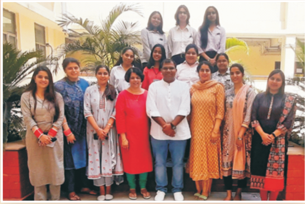
Entrepreneurship Development Cell