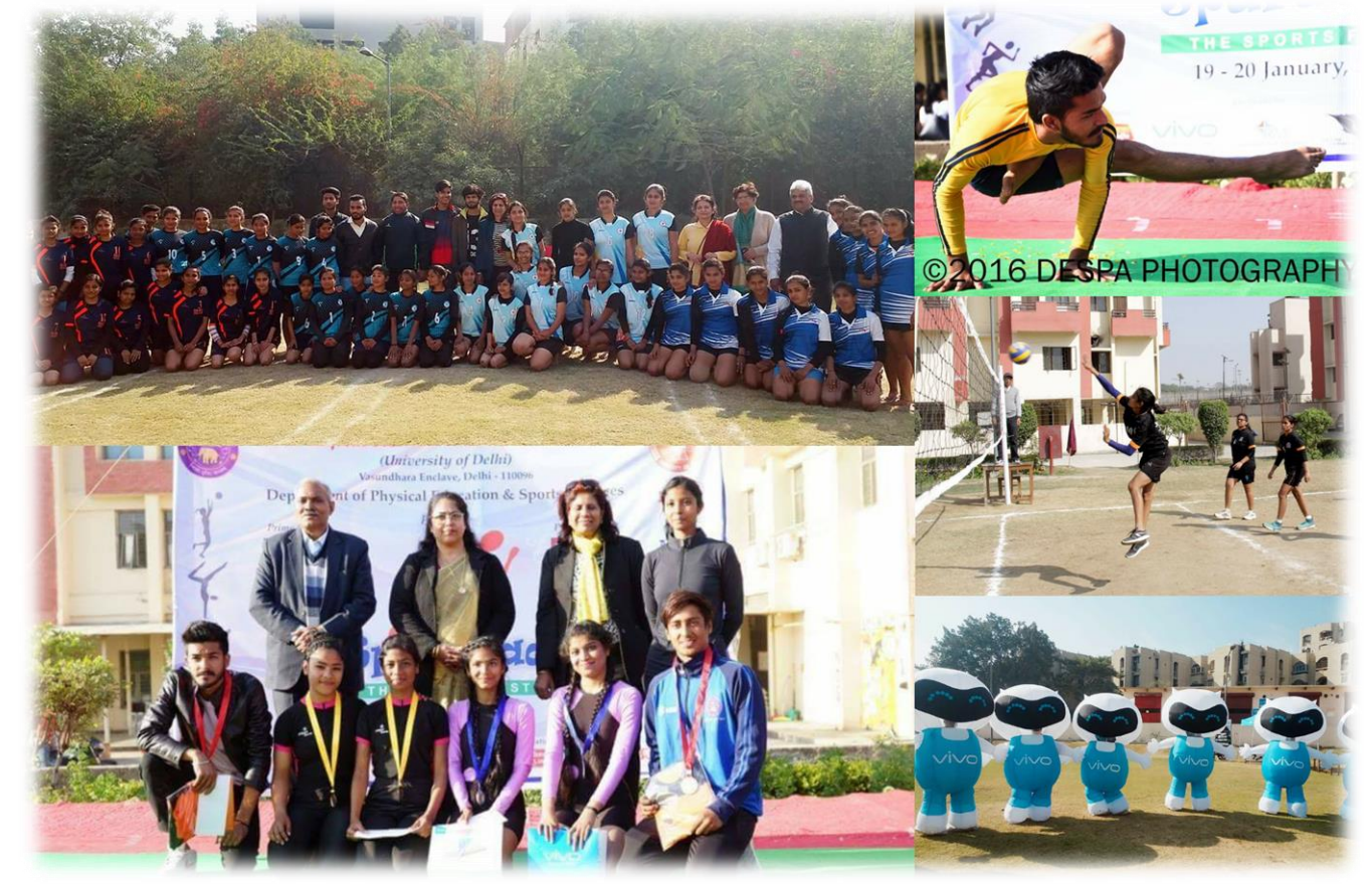
Interviews of the Participants

"We are really grateful to college authorities" Kamala Nehru College, University Of Delhi