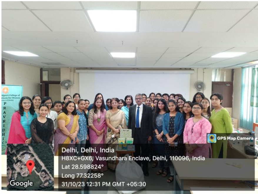
Delhi, Delhi, India H8XC+GX6, Vasundhara Enclave, Delhi, 110096, India Lat 28.598824° Long 77.32258° 31/10/23 12:31 PM GMT +05:30