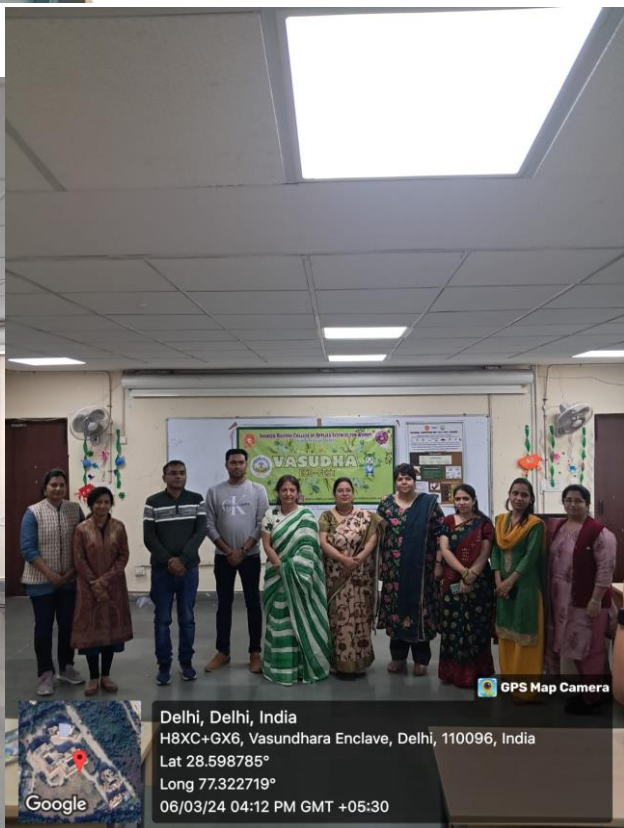
Delhi, Delhi, India H8XC+GX6, Vasundhara Enclave, Delhi, 110096, India Lat 28.598785° Long 77.322719° 06/03/24 04:12 PM GMT +05:30