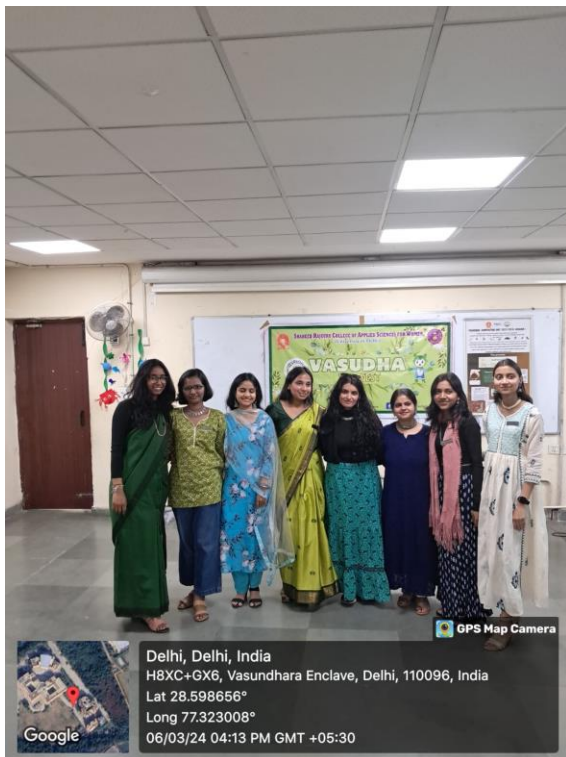
Delhi, Delhi, India H8XC+GX6, Vasundhara Enclave, Delhi, 110096, India Lat 28.598656° Long 77.323008° 06/03/24 04:13 PM GMT +05:30